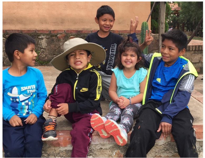
Cami and some of the kids from the boys' home at a foundation activity