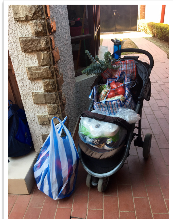
This is a picture of how Sal did most of our shopping during the strict quarantines without transport. Don't worry, there are no kids under the groceries!

During that strict quarantine Sal was only able to help the homes do food/supply purchases and emergency repairs with a special ID that allowed him to circulate outside of restricted hours. Due to the even stricter guidelines within the foundation, the staff stayed anywhere from two to four straight weeks without leaving the front door! (As of today, with only a few exceptions for medical reasons, the entire population of kids within the foundation has not left their front door since March 22nd!). We have been striving daily to find ways to encourage the kids and the staff through these uncertain times, and one of those has been to send out daily scripture messages to all of the staff. Nothing is more comforting than the eternal words of life! (Deut.30:19 ; Psalm 119:89). With all that